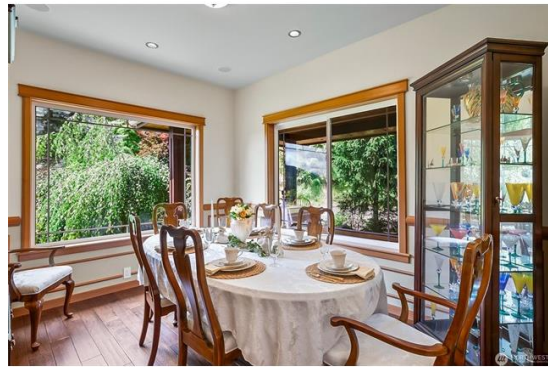
dining room framed by windows