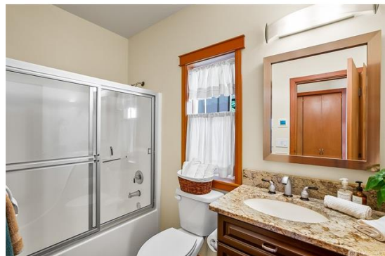
main-level guest bathroom