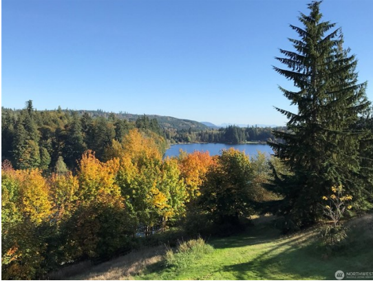
fall colors with cascade peaks in the background

23738 Carlson Place , Mount Vernon 98274