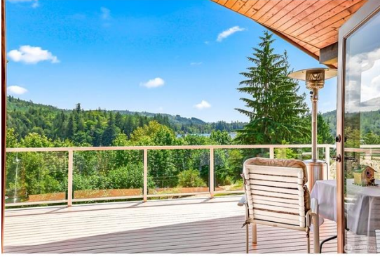
walk out french doors to this view every day

23738 Carlson Place , Mount Vernon 98274