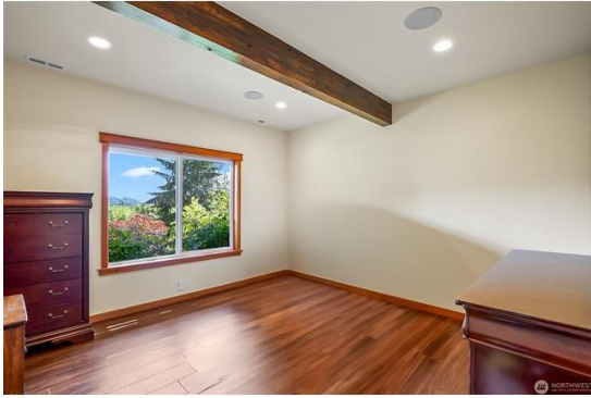
bedroom 5 in lower-level

23738 Carlson Place , Mount Vernon 98274