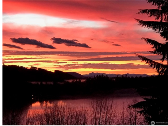
sunrise views while having coffee on your main-level deck