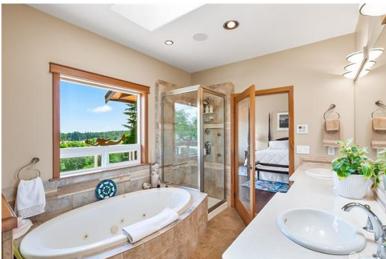
not too many tubs have this view while soaking