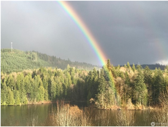
you've found the end of the rainbow here at Lake McMurray