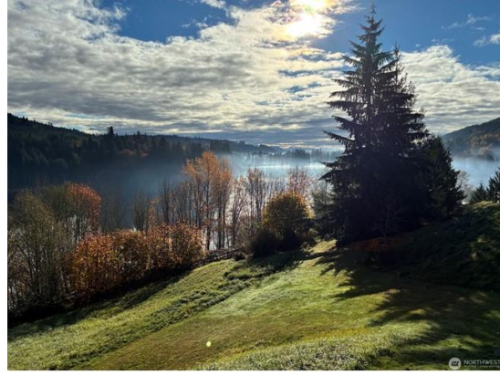
changing views are beautiful in every season