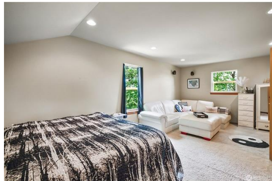
bonus room / bedroom 4