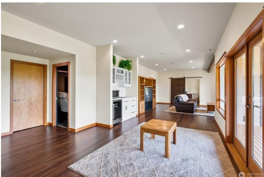
daylight basement (with lots of daylight), has 2 rooms, kitchenette and theatre room