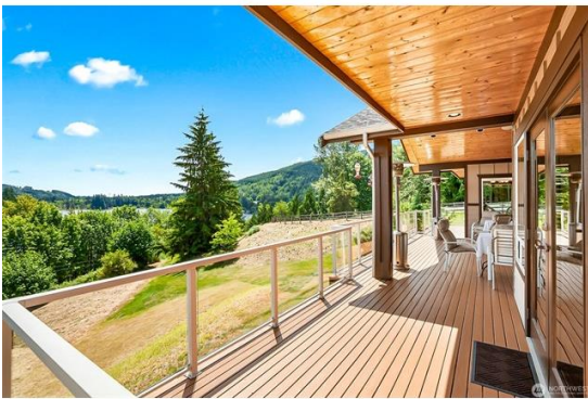
covered deck with panoramic views of lake mcmurray and the mountains