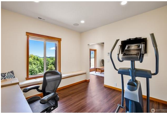
home-gym exercise room or bedroom