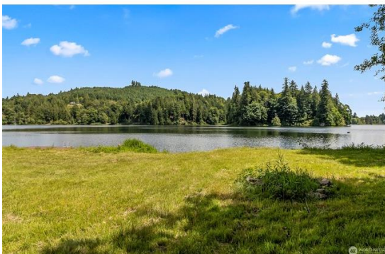
shared lakefront lot with dock