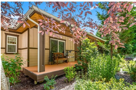
highlighting craftsmanship and well-designed spaces