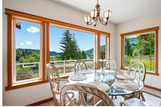
breakfast nook in kitchen