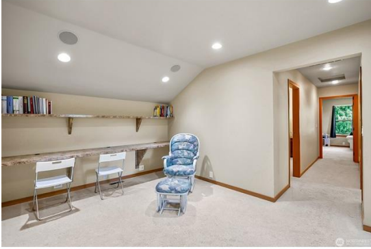
Loft area leading to upper-level bedrooms

23738 Carlson Place , Mount Vernon 98274